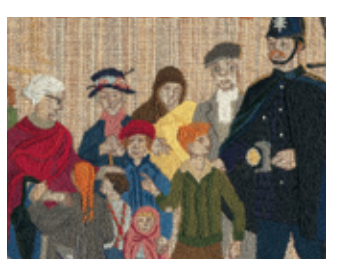
Quaker Tapestry Museum Stramongate, LA9 4BH

350 years of social history and fascinating human stories are brought to life in over 40 vibrant embroidered panels at the award-winning Quaker Tapestry Museum in Kendal.